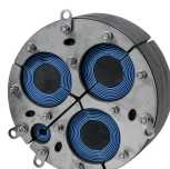
H3+1 UG™ seal

For detailed information, please visit roxtec.com .